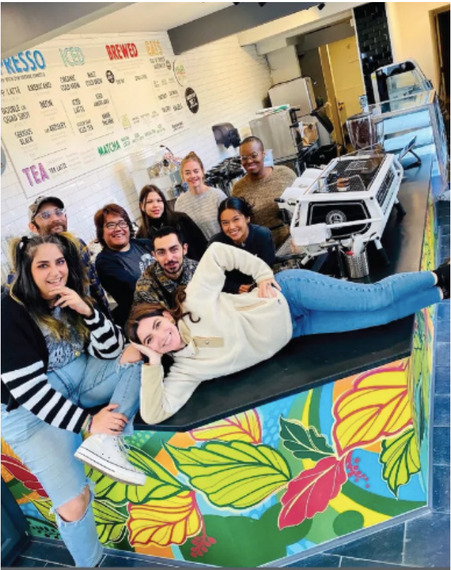
Pictured: The Ardsley Booskerdoo Staff

Overall, Booskerdoo is a great new addition to Ardsley’s town, and is a fitting replacement for the Starbucks that used to copy the same spot. Other options offered on the menu include vegan options in pastries and sandwiches, and numerous teas! The next time you are looking for a coffee, stop by Booskerdoo!